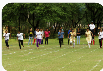
CEMK Sports Event