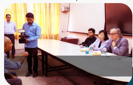
International Placement Conclave