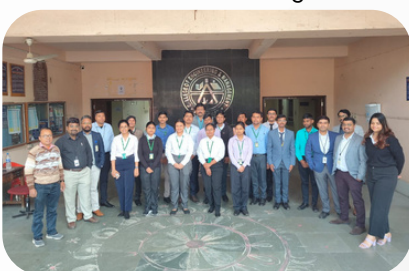
Infosys on-campus drive